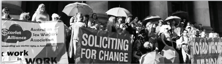
The Australian Sexworkers Association is made up entirely of former or current sexworkers to the exclusion of management

So across Australia it is uneven but the power and the strength of the organisations that have gone in the past and the continuing strength of the Scarlet Alliance has all the peer services in different states is just incredible and I think is unique to Australia in just how strong those relations are. It's pretty exciting to be a sex worker in Australia in that sense - we have to take them as we have them.