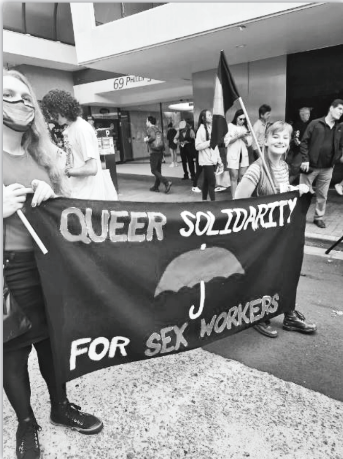
The Scarlet Alliance organises existing peer support networks to ensure the conditions and safety of their members.

This is the next step around organising, dealing with bad bosses, and we don't yet have a union that can go in and industrially represent us in decasualising the industry and actually getting some form of agreement and muscle pushing back against bosses.