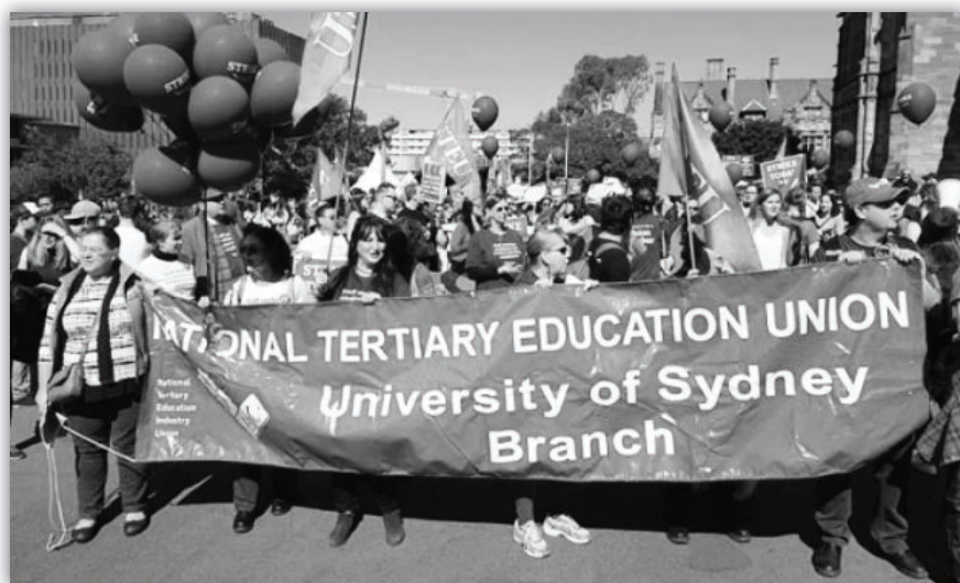
National Tertiary Education Union's branch at the University of Sydney have spearheaded the national campaign for gender affirmation leave.

An open letter addressed to the union branch executive suggesting a review of the gender affirmation claim and with some internal branch discussion, it was decided that the log of claims be amended to include the 30 days with little resistance. After presenting this log of claims to management did concede the 30 days as a one off though did not give further ground as an yearly form of leave, this concession backed by years of militant union participation and workplace density.